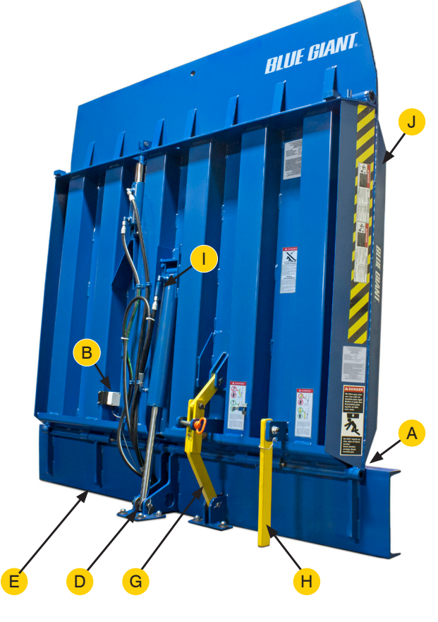
Available in 30,000, 35,000, 40,000, 45,000, 50,000 and 60,000 lb (13,636, 15,909, 18,144, 20,454, 22,727 and 27,215 kg) Rated Capacities