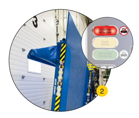
The tilt sensor communicates the deck's position to the control panel, allowing the unit to be safely and properly parked after use.* VL shown with optional draft pad.