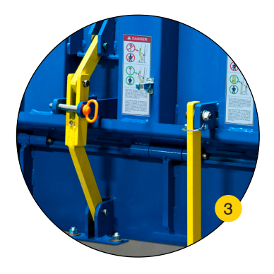
An integral safety stand works with the built-in maintenance strut to provide added safety during maintenance, servicing, and cleaning.*