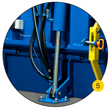
SoftPark™ is a unique protective cushioning that shields the deck cylinder during the parking process.*