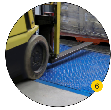
The smooth transition support keeps the cross-docking process steady and even at any grade angle, resulting in higher levels of productivity and efficiency.

*These items are not visible when dock leveler is deployed.